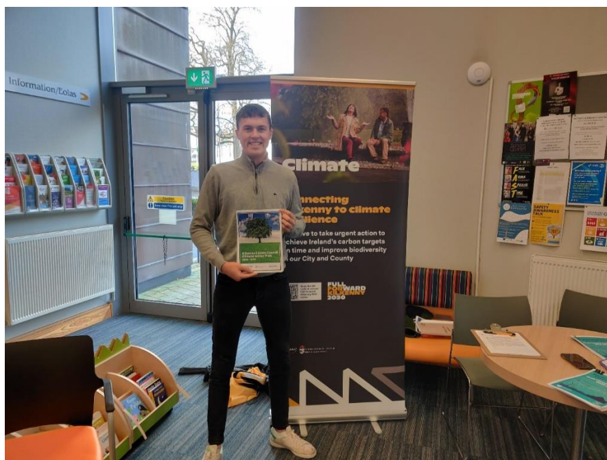
Kilkenny County Council Climate Action Team at public drop in clinic at Ferrybank Library 21 st November 2023