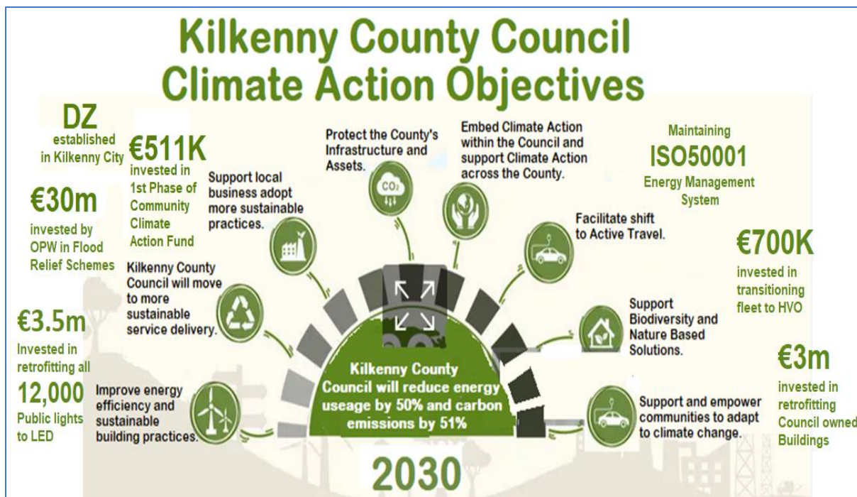
Kilkenny County Council Climate Action Objectives