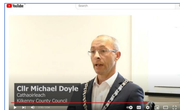
Climate Action video produced by Kilkenny County Council

The Climate Action Office produced a short video outlining the work that Kilkenny County Council is doing to address climate action, as context for the Draft Climate Action Plan. The video was hosted on the Kilkenny County Council YouTube channel and received 289 views from 10 th October, 2023 to 18 th January, 2024. It was also promoted on the Kilkenny County Council Facebook page. An advert ran from 24 th November to 20 th December, 2023. It had a reach of 20,263; 47,109 impressions; and 154 link clicks.