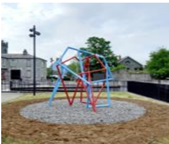
Double Down Sculpture by Isabel Nolan

Gallery site. This sculpture is not a metaphor or symbol, though it will of course be read that way. The public will always adopt and shape the nature of how a work is understood. It’s abstract, Generous and as such it will physically activate and interrupt this space in unexpected and odd ways; drawing people in and adding a new dimension to the site by being unfamiliar, beautiful, complex, and uplifting. (Isabel Nolan, Artist)