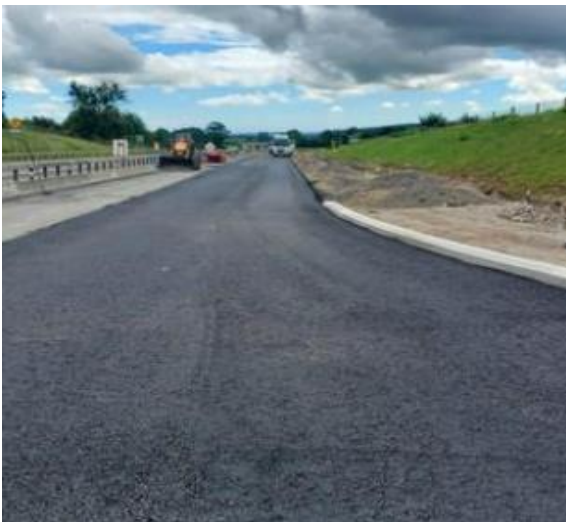
Basecourse works on N24 Main-line

Construction remains on schedule with substantial completion expected by the end of 2023.