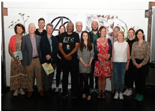
Attendees of the Kilkenny Poetry Broadsheet