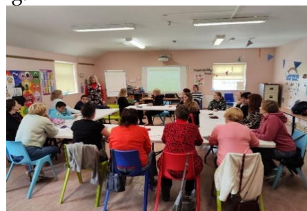
Connect Cafe - Ukrainian Cultural Centre