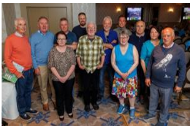
Barn Owl Survey Attendees, River Court Hotel, Kilkenny