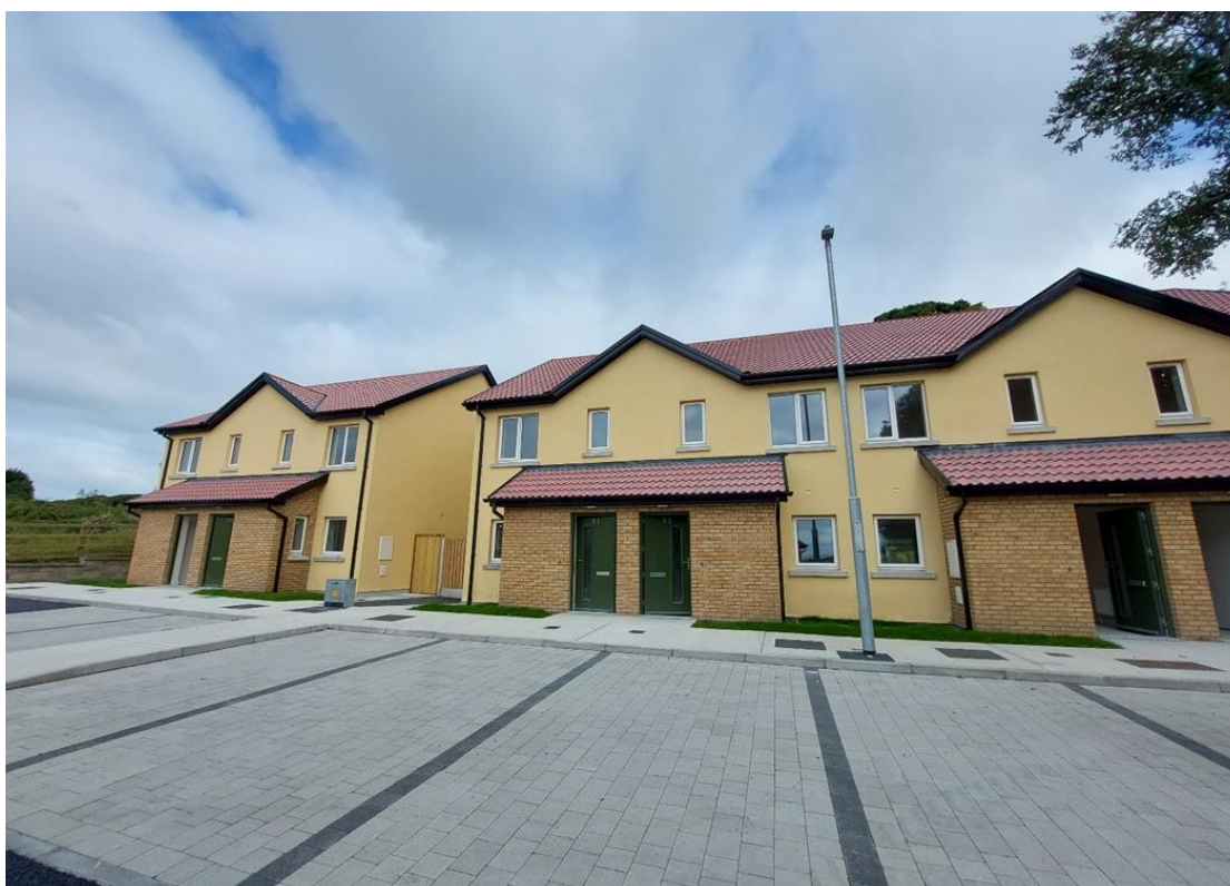
The Crescent, Belmont, Ferrybank