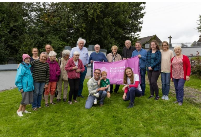
Holy Wells Story Sharing Event, Johns Well organised by Kilkenny County Council Heritage Office as part of the County Kilkenny Holy Wells Survey