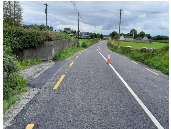
Final Pavement Works N77 Suttonsrath Scheme

The N77 Suttonsrath Pavement Scheme is substantially complete by Priority Construction Ltd. Accommodation works and final snagging are on-going.