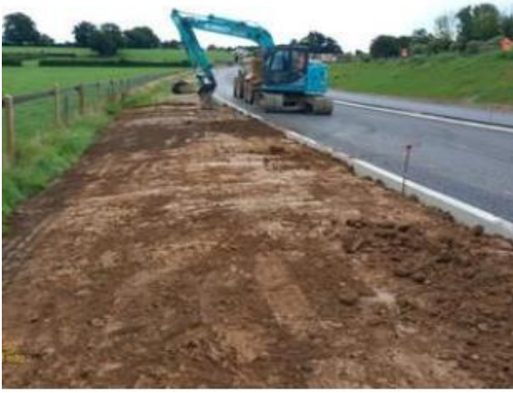
Landscaping works on Link Road