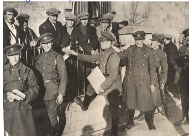
Free State soldiers shake hands with anti-treaty prisoners after the battle of Kilkenny in 1922.