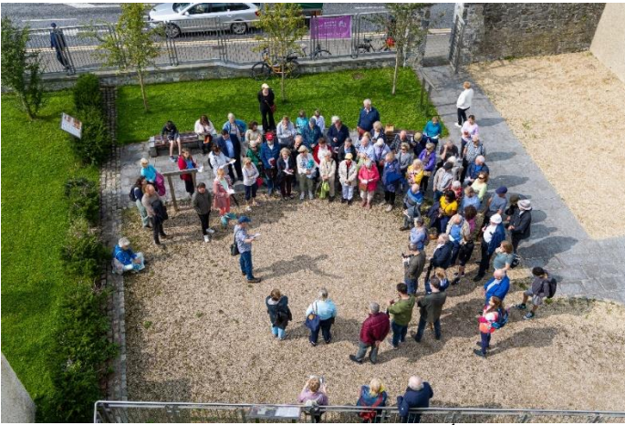
City Walls Guided Tour led by C  il  n    Drisceoil organised by Kilkenny County Council Heritage Office as part of our 2023 Irish Walled Towns programme.