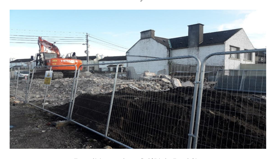
Demolition works at Golf Links Road Site