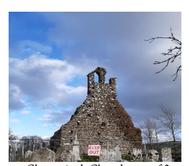
Clomantagh Church, one of 3 applications submitted to CMF

https://kilkennyheritage.ie/2021/11/community-monuments-fund-2022/