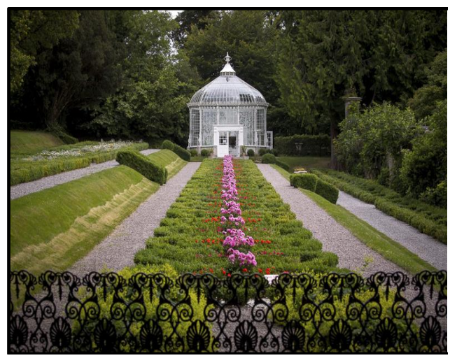
The Flower Terraces at Woodstock in full bloom last summer and the Conservatory house tea rooms which will reopen for the 2022 tourism season soon.

Woodstock Gardens will be seeking seasonal staff to operate the Tea Rooms for the coming tourism season. Advertisements have been placed in local press and on line.