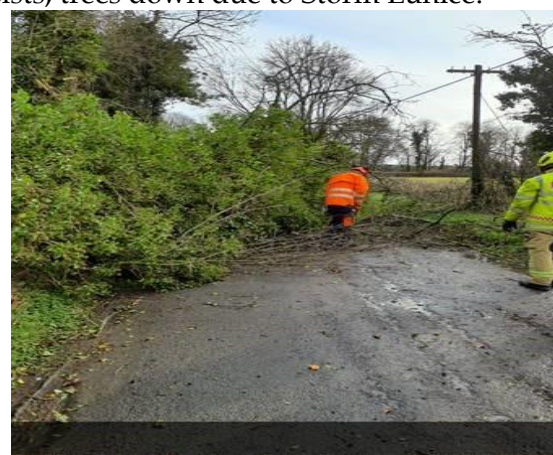
Fire Personnel attending trees down during Storm Eunice

The Brigades have attended over 144 incidents to date. These incidents included a number of road traffic collisions, public road hazards, automatic fire alarm activations, chimney fires, Ambulance assists, trees down due to Storm Eunice.