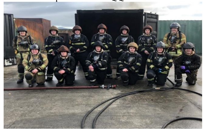
Compartment Fire Behaviour Course Training

Breathing Apparatus are at Level 6 on the National Framework of Qualifications and a component certificate is awarded on successful completion of the course. LASNTG is the accredited provider and ensures that the courses are managed in accordance with the quality assurance requirements of QQI.