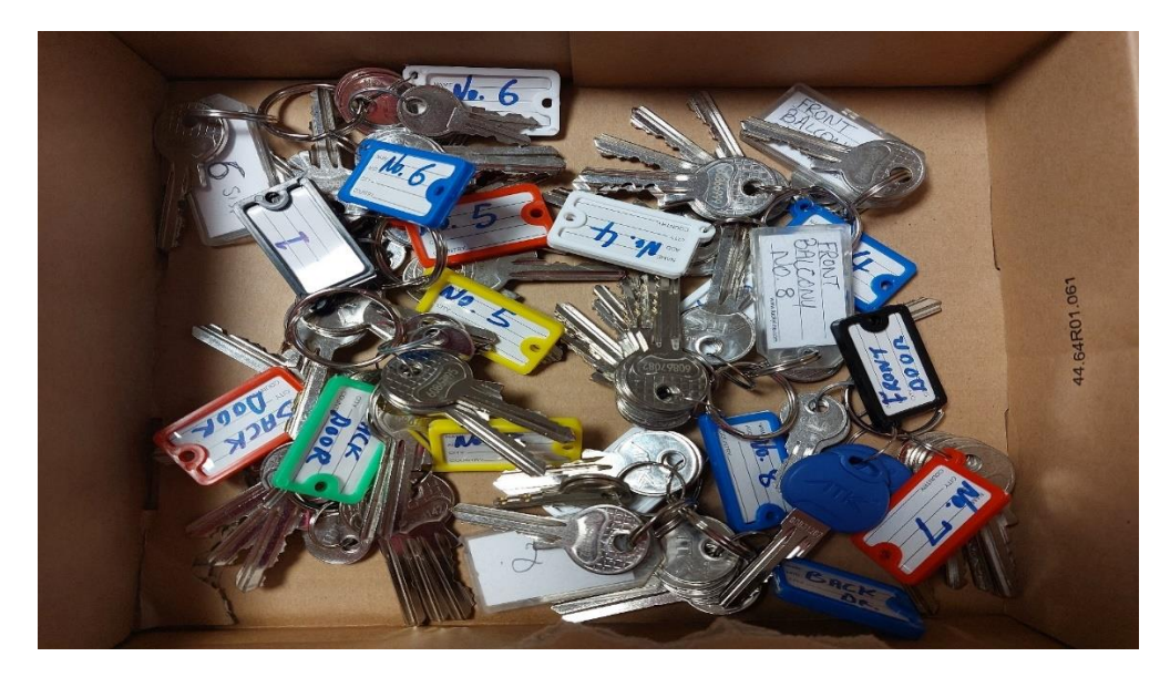
Keys for Pennefeather Court