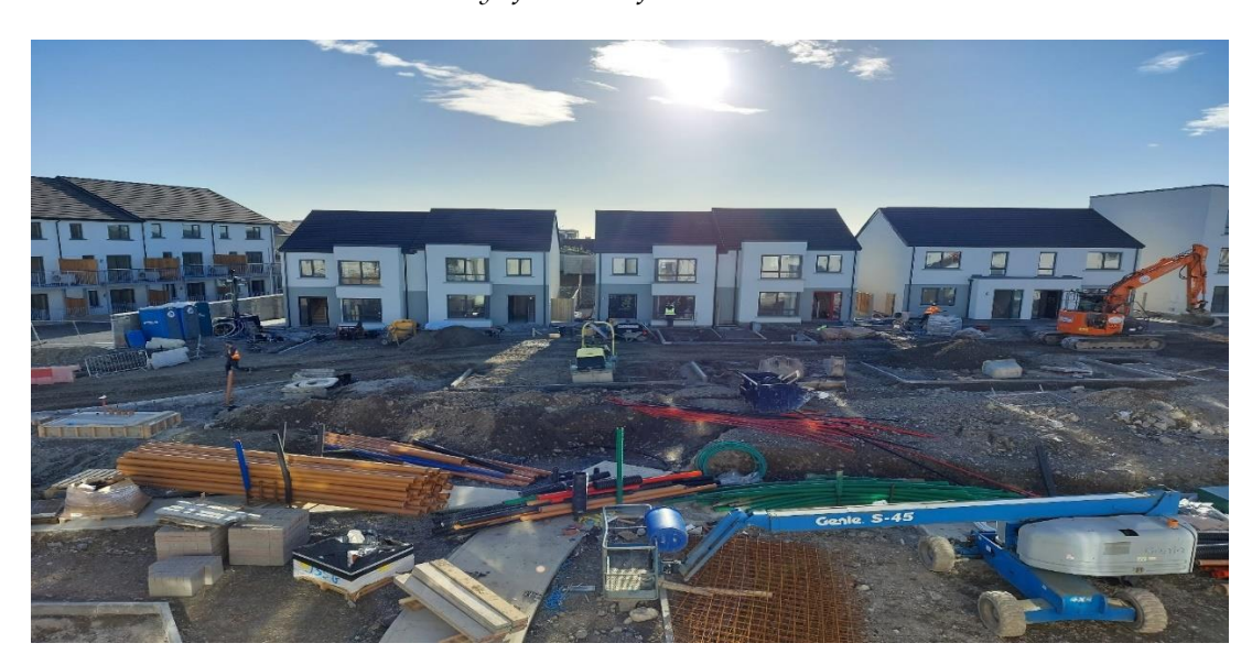
Works at Pennefeather Green