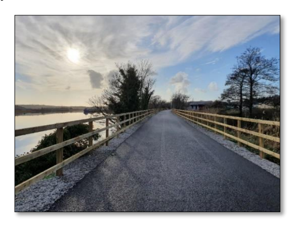
Image of completed section near Shanbogh New Ross with River Barrow vistas

A Part 8 Planning Application is currently being finalised for the development of a temporary construction compound and access at Rathinure to facilitate construction. This access will facilitate construction of the longest section of the Greenway where the majority of agricultural crossings are located from the Ferrybank environs to Aylwardstown.