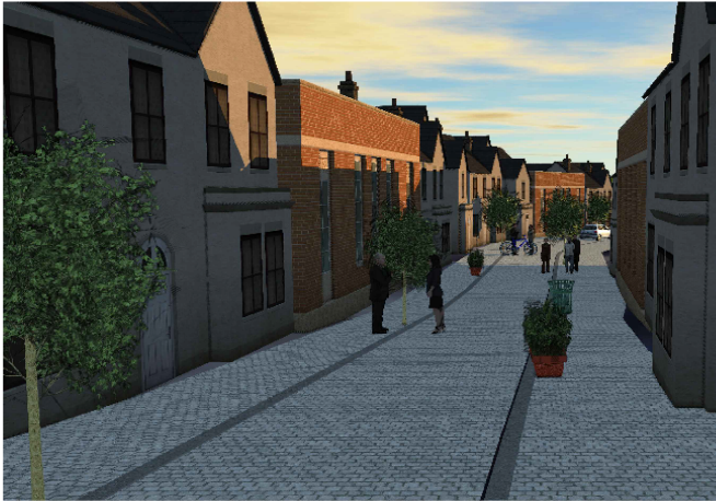
INSET - VISUALISATION FOR SHARED SURFACE ON BRIDGE STREET