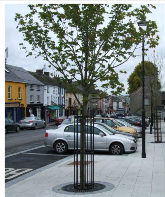
Typical Tree Guard & Paving Detail