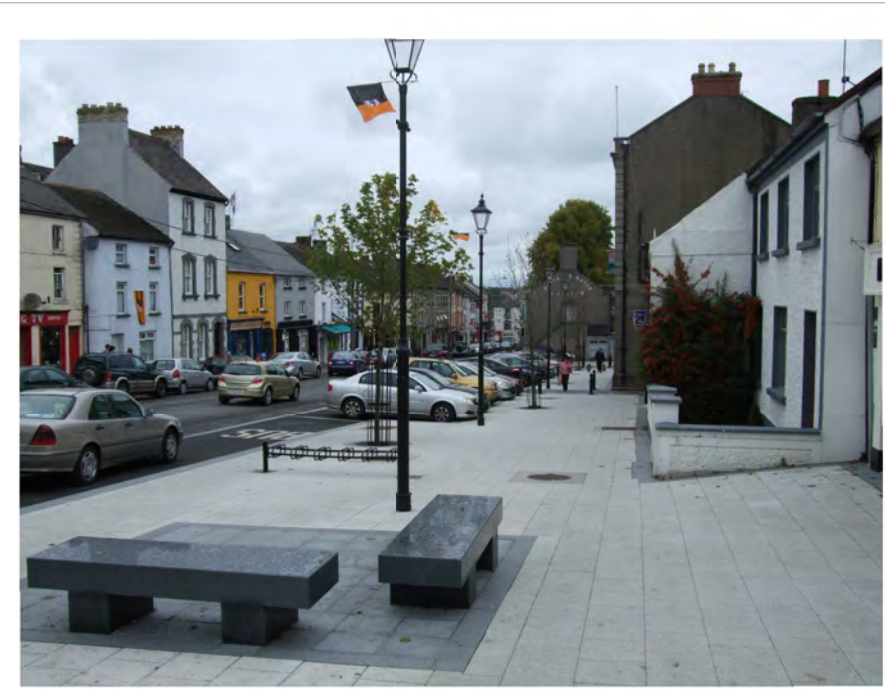
Typical Paving Detail