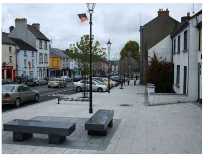
Typical Paving Detail