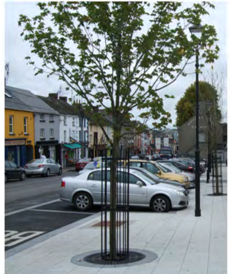
Typical Tree Guard & Paving Detail