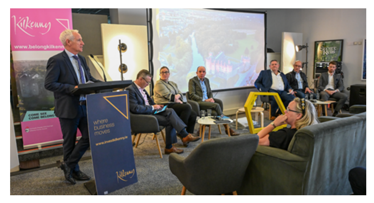
Kilkenny Business Briefing