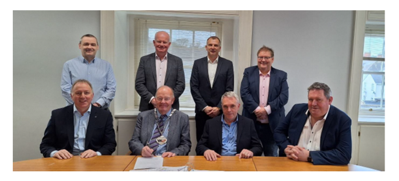
Abbey Quarter Park Signing