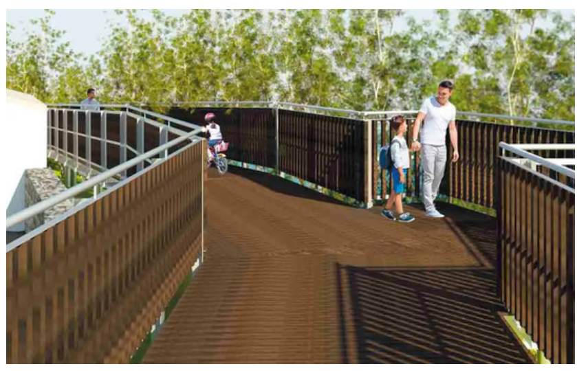
Boardwalk at Greensbridge