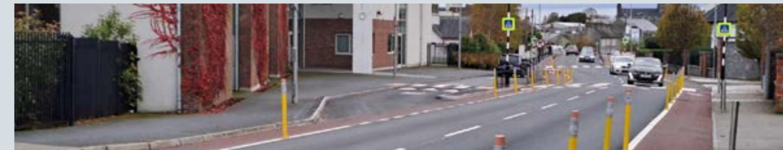
New cycle tracks built outside Loreto Secondary School