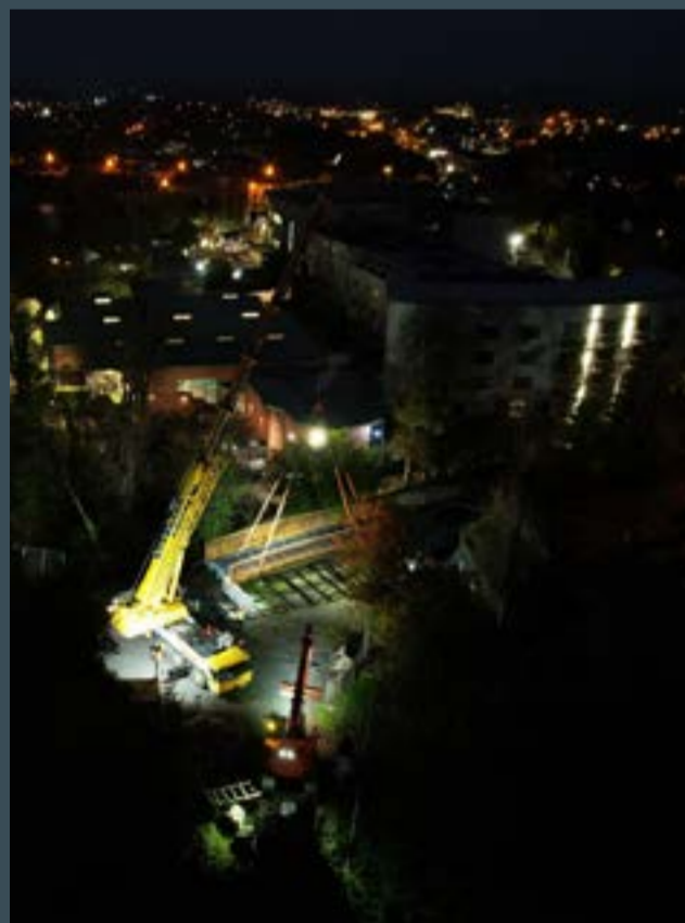
Bridge lift over Breaghagh

Feedback received from the surveys and the workshops will inform the Urban Design Strategy. The timeframe for completion of the Strategy is November to December 2024.