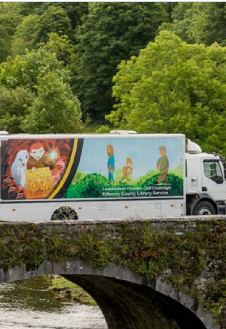
Kilkenny County Council Mobile Library Bus