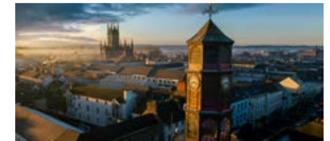
Our Vision.

Person: Putting people at the centre of climate action is key to avoiding the worst impacts of climate on all.