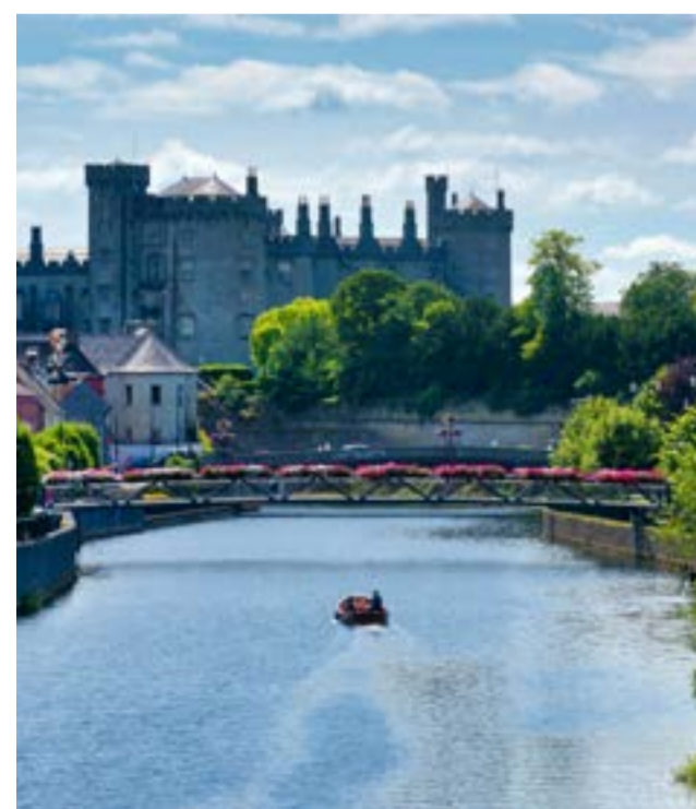
View of Kilkenny Castle from the Nore River, Kilkenny City

In addition, the Council supports other events through its Festivals and Events Grants Assistance Scheme. For more information https://kilkennycoco.ie/eng/your_council/online-services/apply-for-it/