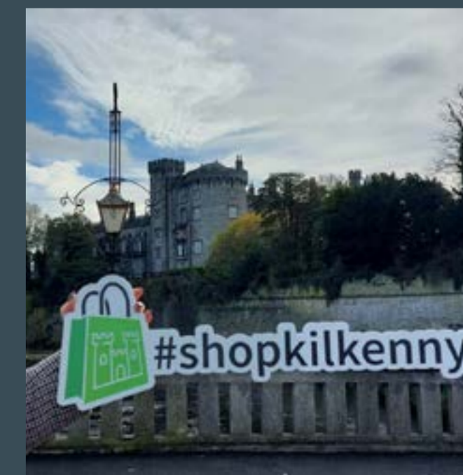
#SHOPKILKENNY logo outside Kilkenny Castle

To find out what's happening with Shop Kilkenny you can do so by following Instagram @shop_kilkenny, or on Facebook @shopkilkenny and don't forget to follow and share using the hashtag #ShopKilkenny.