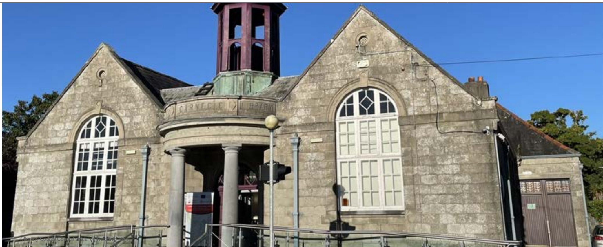
"Kilkenny City Library" John's Quay Kilkenny