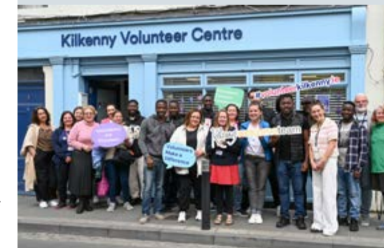
Members of Kilkenny County Council Tourism Section and Members of the Kilkenny Welcome Team 2024 taken outside the Kilkenny Volunteer Centre