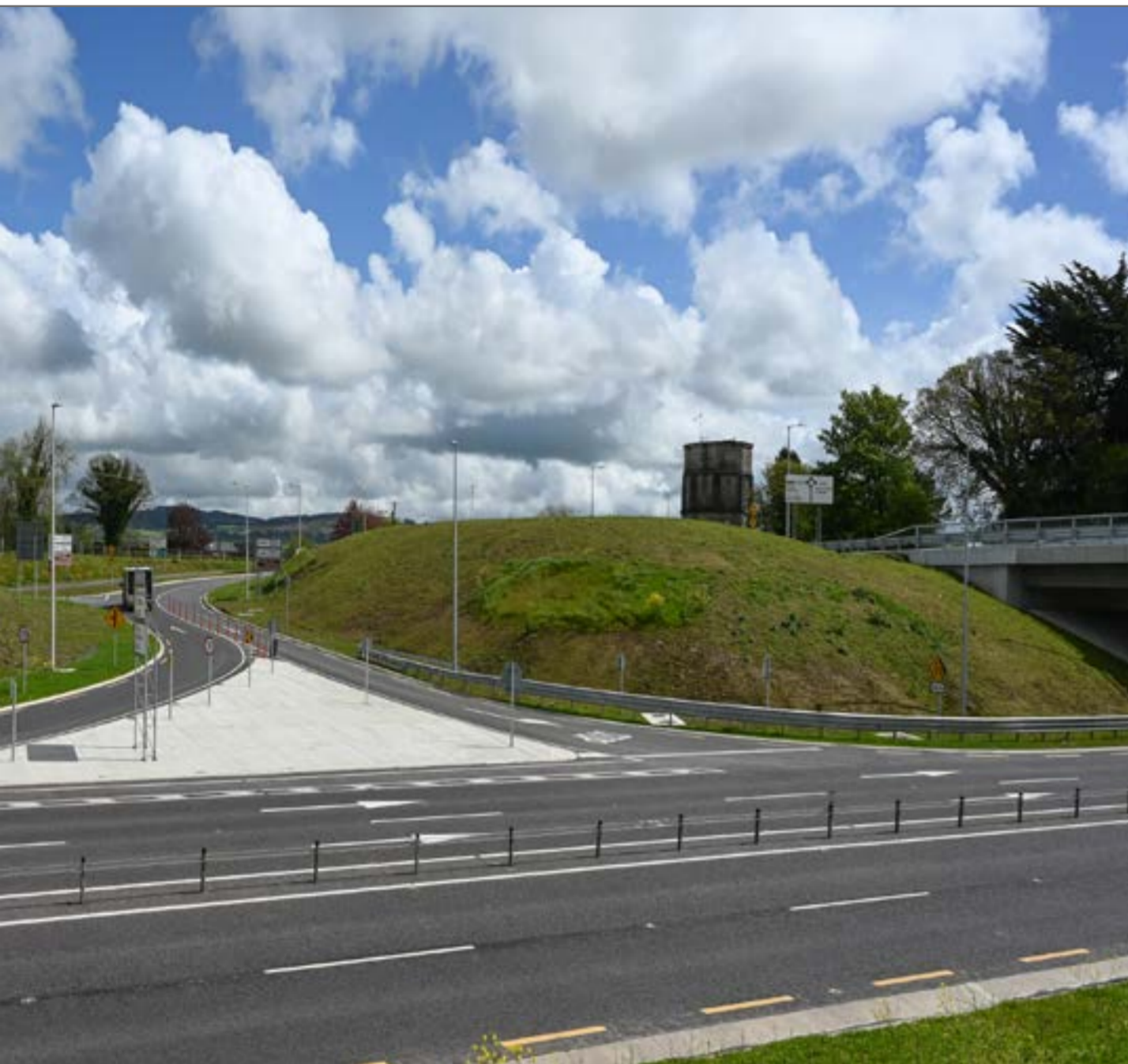
The completed N24 Tower Road Junction