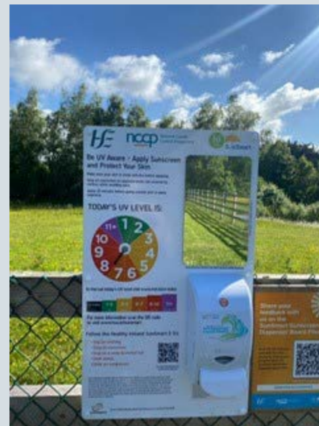
SunSmart dispenser at Kilkenny Countryside Park in Dunmore

The first national litter survey by the business group Irish Business Against Litter (IBAL) since the introduction of the Government's Deposit Return Scheme revealed a decrease in cans and plastic bottles on the streets, contributing to an overall improvement in litter levels. There was an increase in the number of sites deemed clean across the country, with a significant reduction in those judged to be 'heavily littered'.