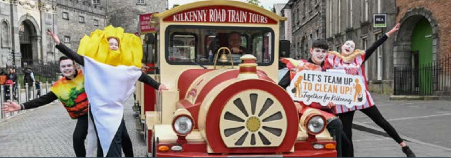
Launch of Team Up To Clean Up 2024