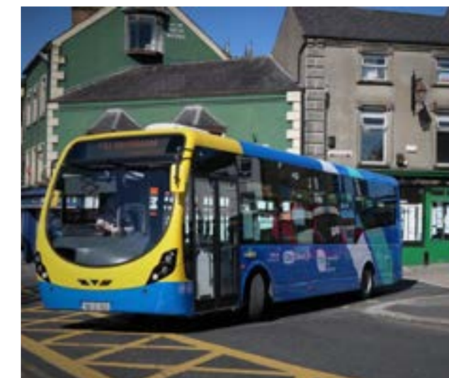
The bus and bus shelters now in place across Kilkenny City