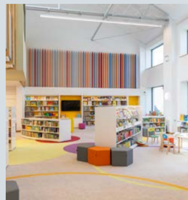
Interior and reading area in the Mayfair Library

It marked the culmination of a 12-month construction period aimed at enhancing road safety and connectivity on the N24.