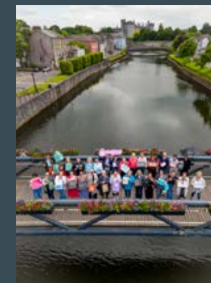
Retailers on Lady Desart Bridge, Kilkenny City #ShopKilkenny

Kilkenny's commitment to excellence in hospitality and continuous efforts to enhance the visitor experience have truly paid off. As the City continues to innovate and evolve, it remains dedicated to providing luxury experiences that captivate and inspire travelers from around the globe.