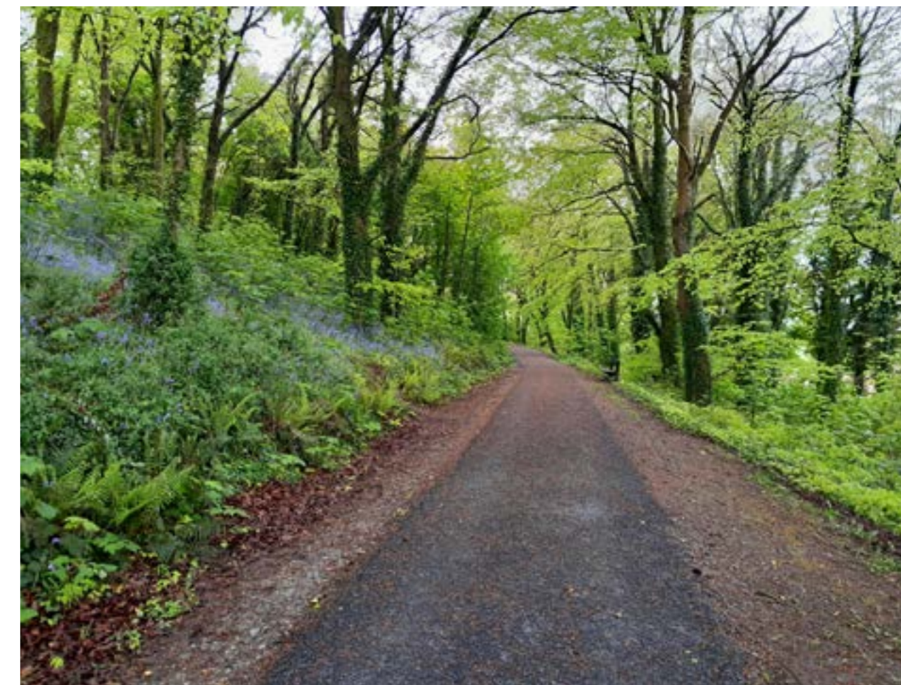
Newly developed walkway around the Deerpark Area

For more tips, visit SunSmart hub and follow #SunSmart on social media.