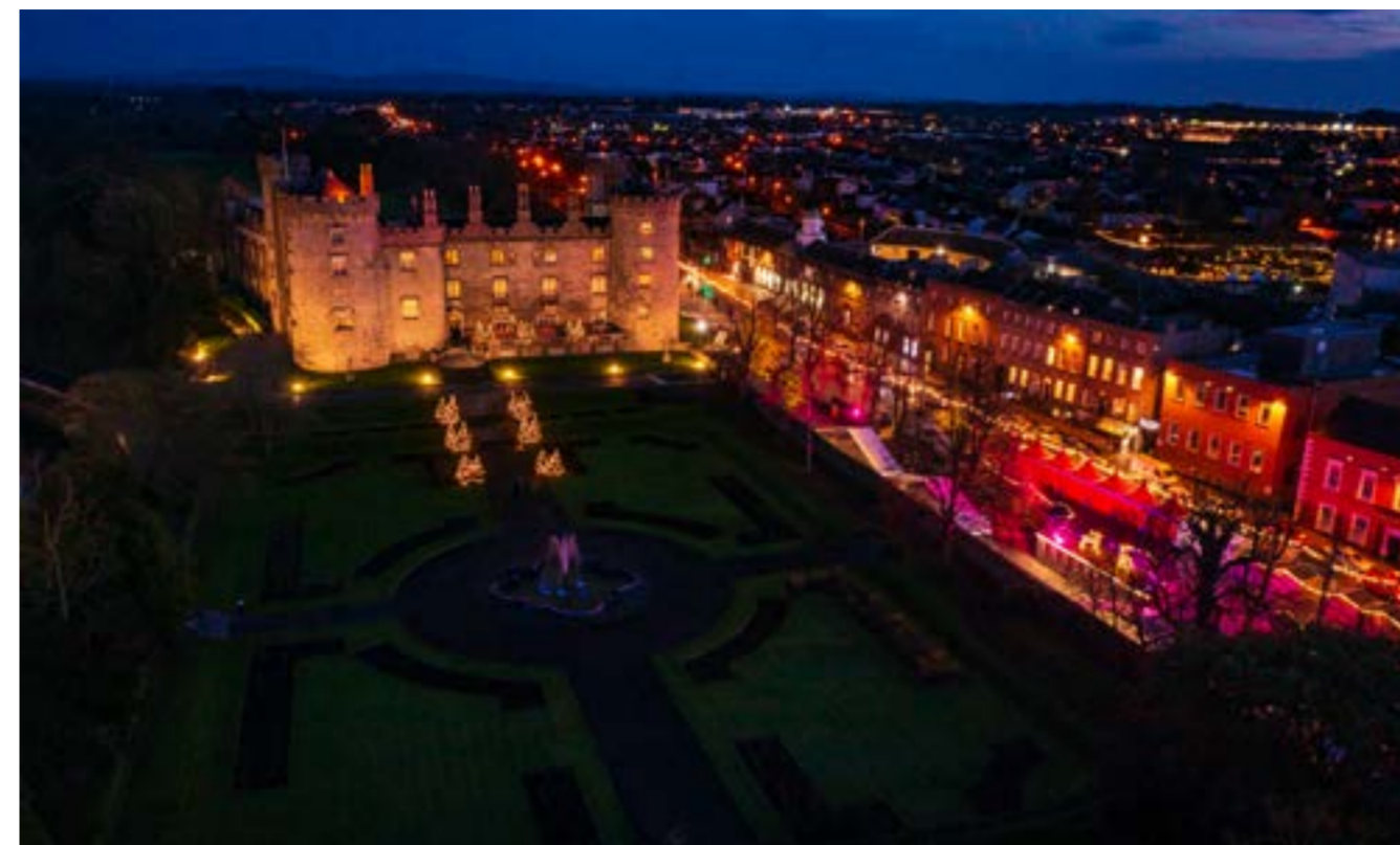
Kilkenny City and Kilkenny Castle lit up for Christmas as part of Yulefest Kilkenny

The bridge itself is a marvel of engineering. Donnelly Civil Engineering Ltd. successfully installed the 16.5 metre span steel bridge, a robust 12-tonne structure designed by Kilgallen and Partners Consulting Engineers Ltd. This project not only showcases the technical expertise involved but also highlights the community's commitment to improving local infrastructure and enhancing the quality of life for its residents.