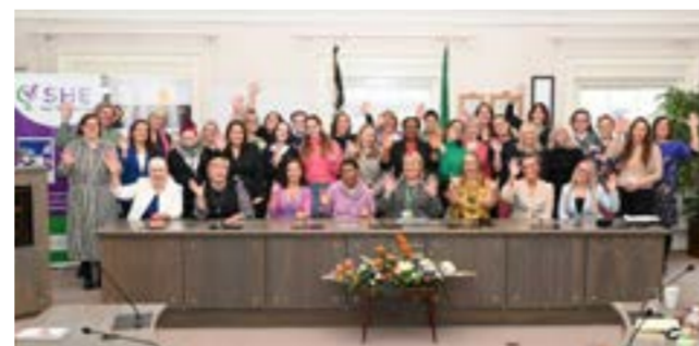
A group photograph of all participants and attendees at Kilkenny Women and Politics Event