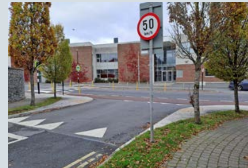
New cycle track built outside Loreto Secondary School

This scheme consists of 11 new crossings and improved footpaths, cycle paths and junctions on the Granges and Freshford Roads. The scheme will improve infrastructure and slow traffic on the routes to school, creating a safer environment for the large number of children and young people attending Loreto and St. Canice's Schools. The interventions were based on survey findings, audits and consultation with the school communities. Students have consistently cited safety as the main barriers to active travel and this scheme aims to encourage independent journeys for all, particularly for children and young people, reducing the demand for care journeys. Other schools in Kilkenny on the Safe Routes to School Programme are the three schools in Graiguenamanagh and St. John of God and St. Patrick's De La Salle in Kilkenny City.