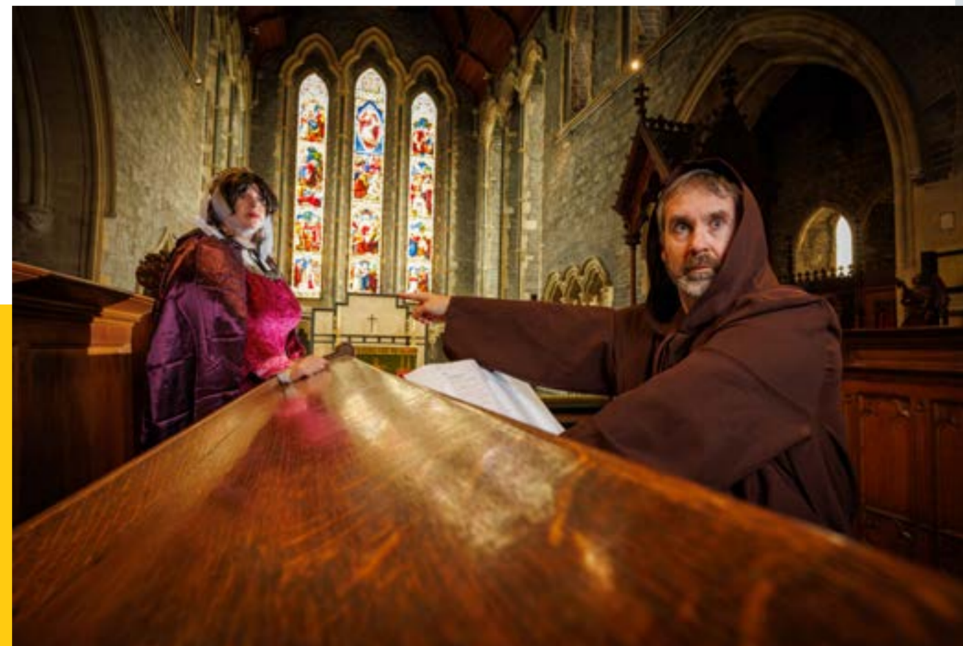
Actors from the reenactment of the burning of petronella at the launch of "Toil and Trouble"