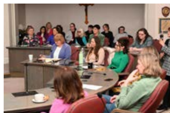
Participants at the Kilkenny Women and Local Politics Event which was organised by Kilkenny County Council to mark International Womens Day 2024.