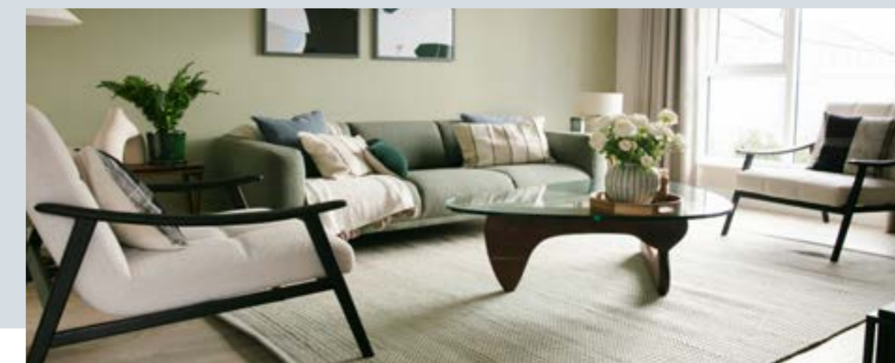
Image of living room from the affordable housing project

https://kilkennycoco.ie/affordable-homes