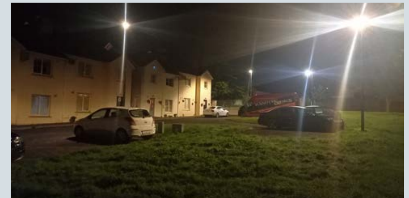
New fitted LED lights outside houses

These lights use 34% of all the energy consumed by Kilkenny County Council. They also generate 41% of the Council's greenhouse gas emissions. The Council is working to change all public lights to more energy efficient LED lights, through the National Public Lighting Energy Efficiency Project. LED lights use about half the energy of traditional public lights and last longer. Changing to LED lights is better for the climate, it cuts energy use in half, reduces CO2 emissions and saves public money.