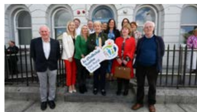
Minister Heather Humphreys, Members of Kilkenny County Council and Members of the Urlingford Town Team at the official opening of the EXIT 4 remote working hub

EXIT 4 remote working hub facilities are now open. Flexible plans are available to meet the needs of clients. For enquiries and to make a booking, go to Exit4Urlingford.ie